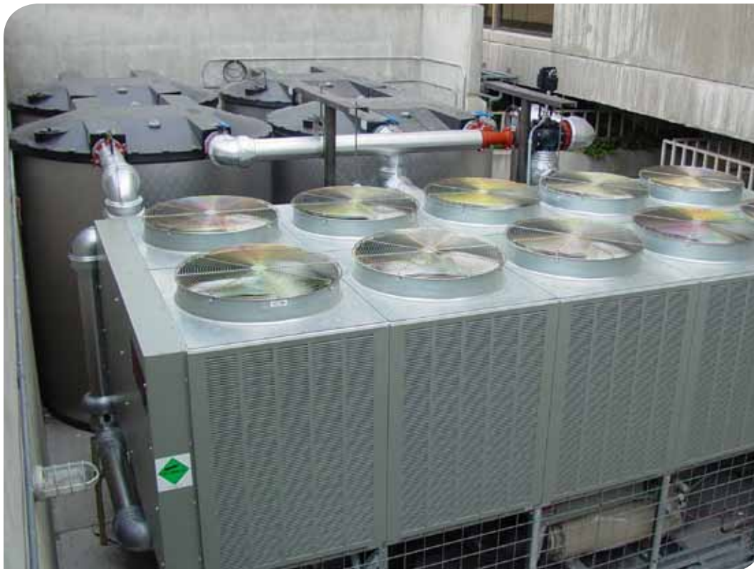
One way Trane reduces energy costs is with a thermal storage system design that uses ice made at night, when energy demand and cost are lowest, to cool the building during the day.

Another energy-saving strategy is a thermal storage system that uses ice made at night, when energy costs are lowest, to cool the building during the day. Thermal storage can be used in many settings, including schools, government buildings and industrial processes.